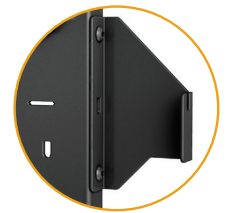
MODULAR SYSTEM DESIGN