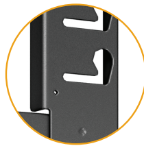
OFFSET DISPLAY MOUNTING SLOTS