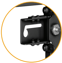
KEYHOLE MOUNTING SLOTS