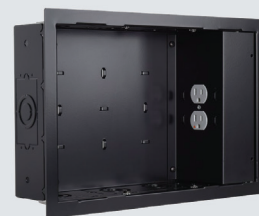
PAC525, PAC526 & PAC527 In-Wall Storage Boxes