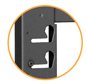
Friendly Clearances provide the needed freedom for aligning fine pixel pitch LED displays