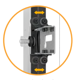
Z-axis plumb adjustments compensate for wall imperfections to achieve perfectly flat mounting surfaces