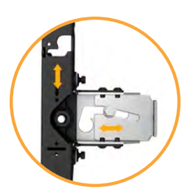
Y-axis vertical shift adjustments provide perfect cabinet-tocabinet alignment