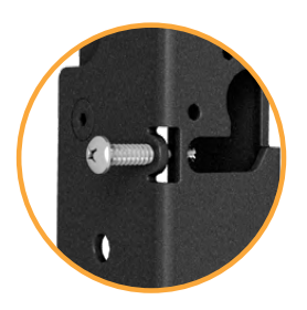
Side Lock Screws lockout LED configuration eliminating cabinet movement