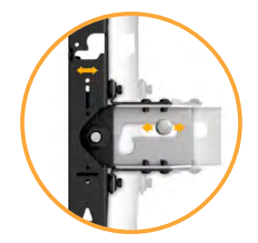
X-axis lateral shift adjustments enables perfect LED positioning