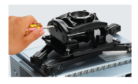
Microzone™ Adjustments make projector registration fast and precise (including flush-mount installations).