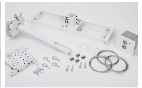
Suspended Ceiling Projector System with Filter & Surge SYSAUBP2/SYSAUWP2