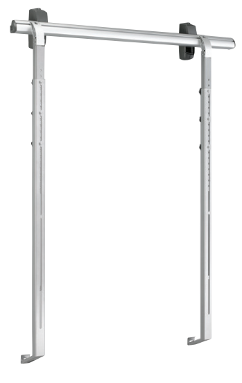
WBM3E TELESCOPING WHITEBOARD WALL MOUNT

The WBM3E installs directly to the wall over pre-existing dry erase boards or chalkboards without causing damage, providing the flexibility needed for classroom environments.