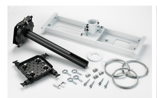
Suspended Ceiling Projector System SYSAUB/SYSAUW