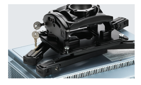
Q-Lock™ quick release provides quick connect/disconnect of the projector for service and enhanced security with an integrated key and lock system.