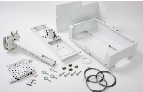
Suspended Ceiling Projector System with Storage SYS474UB/SYS474UW