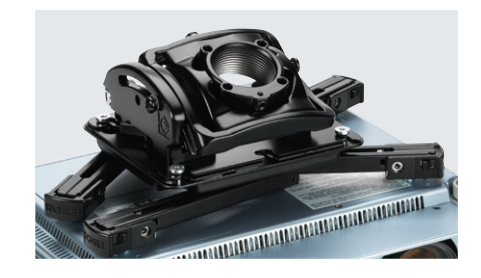
Centris® Technology enables effortless fingertip positioning. Self-adjusts to support different projector weights.