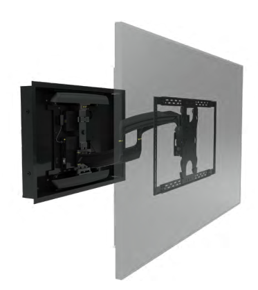
TS525TU Thinstall Dual Swing-Arm Mount extended with TAB1 and TA500 In-Wall Box, sold separately