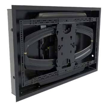
Complete mount installation without display