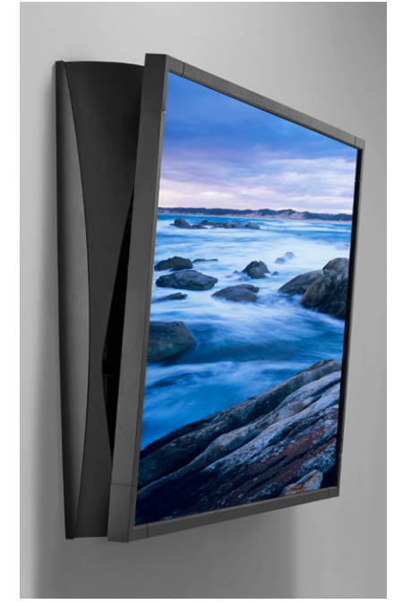
FCA106 Shown with LTM1U