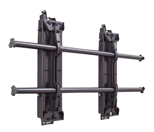
FCAV1U Shown retracted with LTM1U

Download full Fusion Pull-Out Accessories Flyer for more information including technical drawings