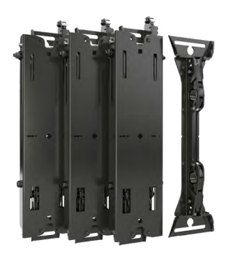
FCAXV1U 3x scissor arm assemblies, 1x wall plate & hardware