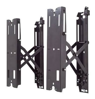
FCAV1U 2x scissor arm assemblies & hardware