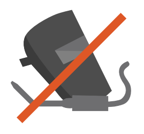
WELD FREE DESIGN