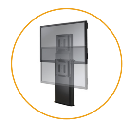
BROAD RANGE OF HEIGHTS/POSITIONS