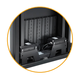
CABLE MANAGEMENT & STRAIN RELIEF