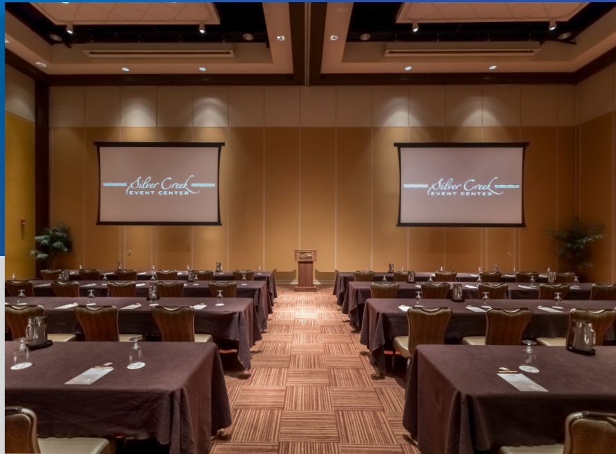
Wireline screen surfaces drop low enough for viewers to comfortably view presentations at the Silver Creek Event Center.

Due to 24.5 foot (7.46 meters) ceilings in four conference rooms, the projection screens originally installed didn’t drop low enough for viewers to see projected content clearly without straining to look up and taking their focus off the presenter. The