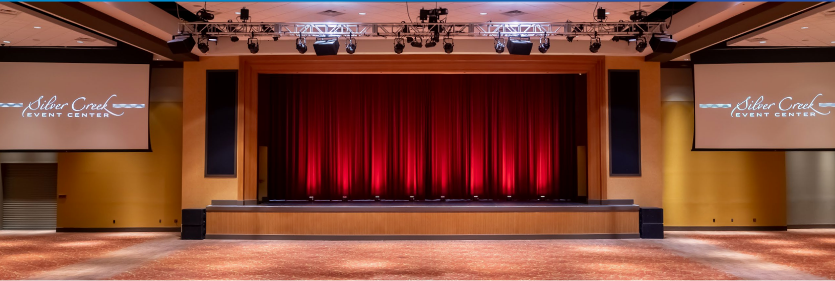
Customized Tensioned Professional screens flank the Silver Creek Event Center stage.