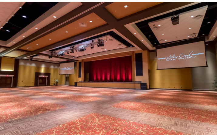
Customized Tensioned Professional screens flank the Silver Creek Event Center stage.

Projection screens on either side of the stage and along the side walls of the ballroom needed special consideration as well. In such a large space, the size and position of the screens was paramount to ensure everyone in the audience gets the best viewing experience.