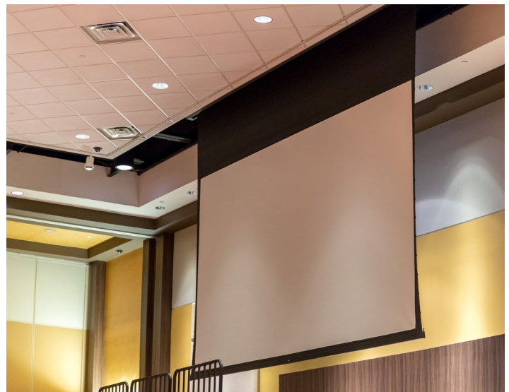
One of the Tensioned Cosmopolitan screens installed along the side of the ballroom, so content can be viewed no matter how the room is configured.