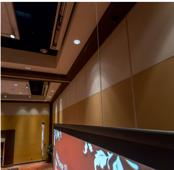
Conference room airwalls behind the Wireline screens can be opened to accommodate larger crowds in the adjacent ballroom. Without black drop, the Wireline blends better with the environment and obscures less of the stage.

“It was a very seamless process from our end as far as getting the customization done to the specific widths that we needed to fit within the soffits of our ceiling in the Silver Creek Events Center,” said George. “The visual is really nice when you walk into the room. You can see the artist up close and personal from the screens.”