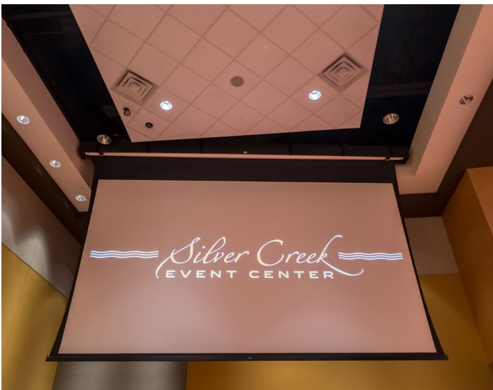
An angled installation of the screens, which are customized to fit ceiling soffits, ensures the entire audience can clearly see them.