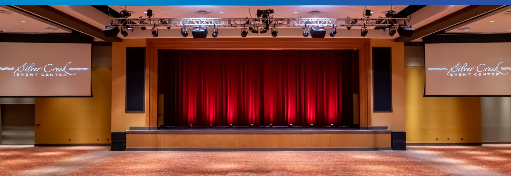
Customized Tensioned Professional screens flank the Silver Creek Event Center stage.