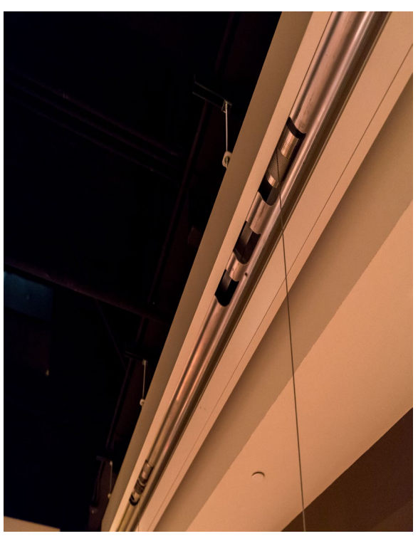
Thin steel cables lower the Wireline screen surfaces which eliminates excessive black drop, preserving room aesthetics and keeping viewers focused on projected content.

Customized solutions were needed for the ballroom. The Da-Lite Design Center assisted in the creation of two Tensioned Professional 264" (671 cm) diagonal screens to fit around the stage. Not only was size a factor in ensuring an optimal viewing experience, the screens flanking the stage were angled inward to better align with sight lines of the audience. Two Tensioned Cosmopolitan 220" (559 cm) diagonal screens, installed above side entrances to the ballroom, guarantee viewers can easily see projected content regardless of how the room is set up.