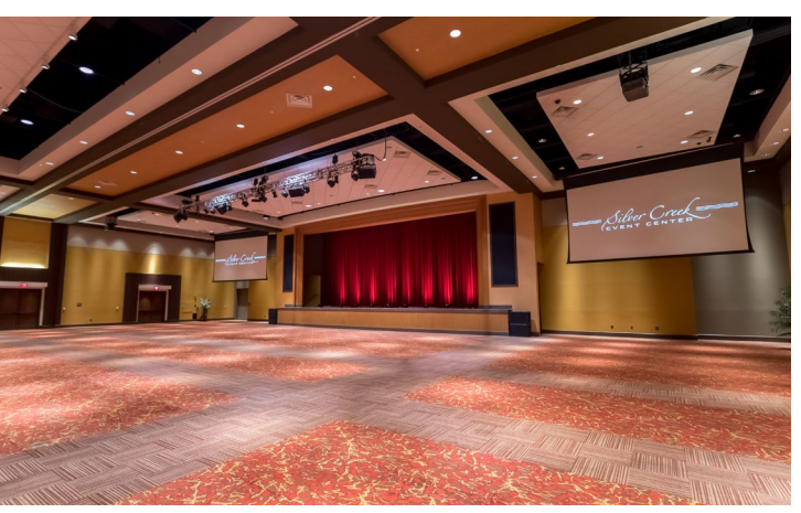
Customized Tensioned Professional screens flank the Silver Creek Event Center stage.

Due to 24.5 foot (7.46 meters) ceilings in four conference rooms, the projection screens originally installed didn't drop low enough for viewers to see projected content clearly without straining to look up and taking their focus off the presenter. The