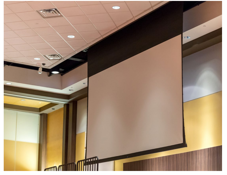
One of the Tensioned Cosmopolitan screens installed along the side of the ballroom, so content can be viewed no matter how the room is configured.