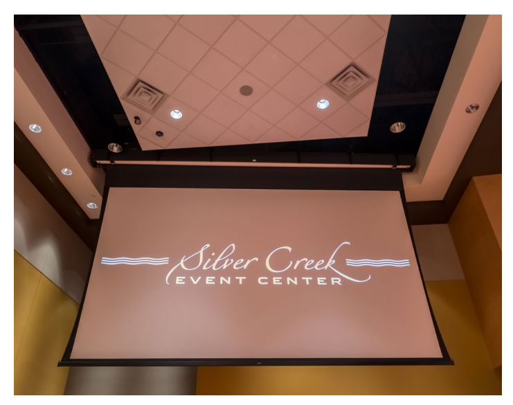
An angled installation of the screens, which are customized to fit ceiling soffits, ensures the entire audience can clearly see them.