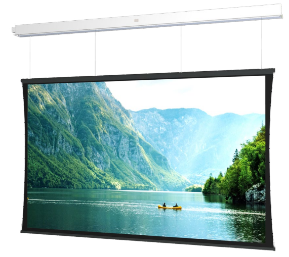
ALR and High-Resolution Screen Surfaces up to 16K!