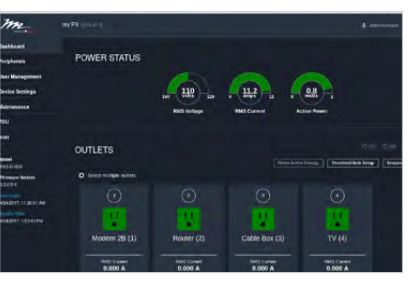
Actual app interface - it's really this easy!