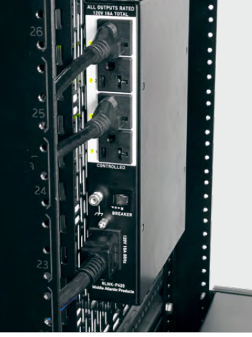
Compact form factors are a smart use of space. Try mounting on our patented Lever Lock<sup>™</sup> plates for intelligent power that takes up zero RU.