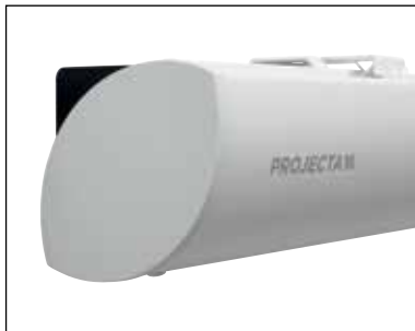
Leaf shaped case design