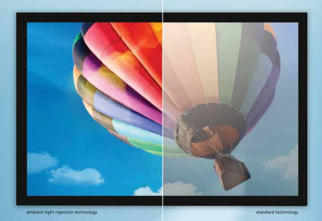
blocks ambient light for a bright