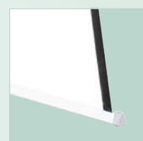
Triangular slat bar