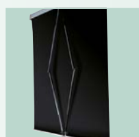
Tensioning arm at the back