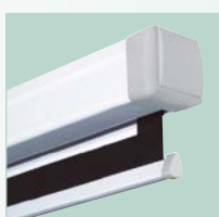
Professional quality manual projection screen