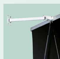
Standard with extension bracket