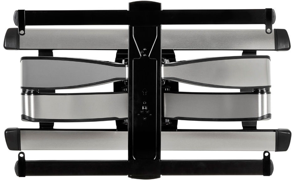
BRUSHED SILVER STAINLESS