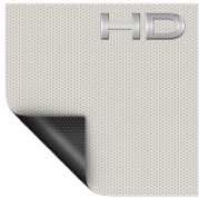
HD Progressive 1.1 Contrast Perf Half Angle: 60° Gain: 1.1