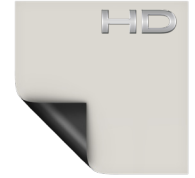
HD Progressive 1.1 Contrast Half Angle: 60° Gain: 1.1