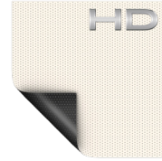
HD Progressive 1.1 Perf Half Angle: 85° Gain: 1.1