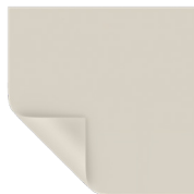
Ultra Wide Angle Half Angle: 78° Gain: 0.65