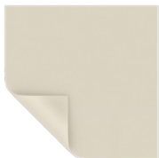
Dual Vision Half Angle: 65° Gain: 0.9