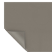
High Contrast Da-Tex Half Angle: 40° Gain: 1.0