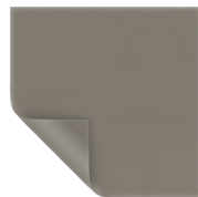
Da-Tex Half Angle: 30° Gain: 1.3