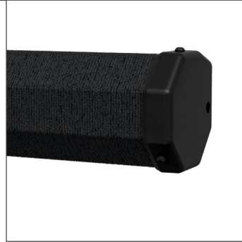
Black Carpet Case