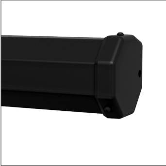
Black Case (Standard)