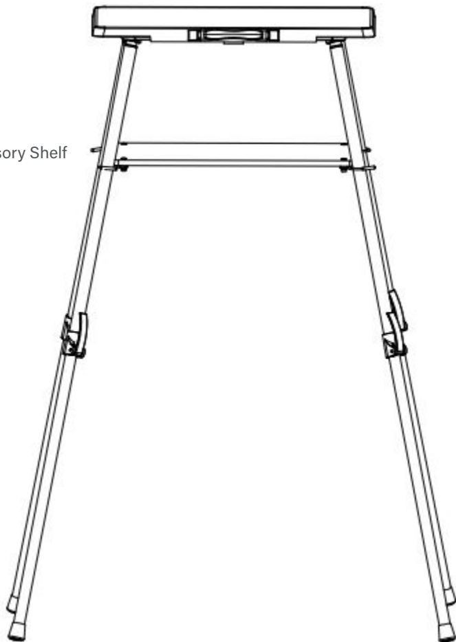
Model 208 Accessory Shelf

Convenient 14½" x 22" x ½" shelf may be used on all Project-O-Stands to create a convenient storage place. Shelf is made of wood composition board with plastic laminate top and vinyl edges.