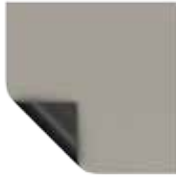
High Contrast Da-Mat