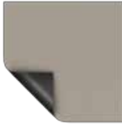
High Contrast Audio Vision