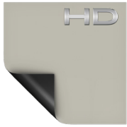
HD Progressive 0.6 Half Angle: 85° Gain: 0.9