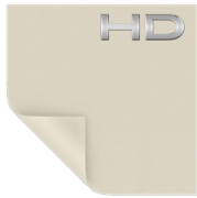
Dual Vision Half Angle: 65° Gain: 0.9