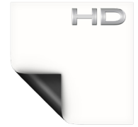
HD Progressive 1.3 Half Angle: 75° Gain: 1.3