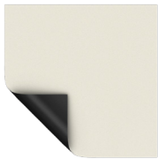
Da-Mat Half Angle: 60° Gain: 1.0