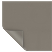
Da-Tex Half Angle: 30° Gain: 1.3