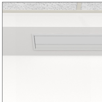
In Ceiling (Closed)