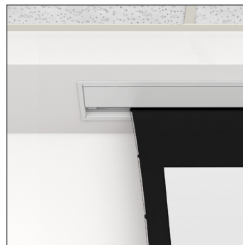
In Ceiling (Open)