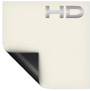
HD Progressive 0.9 Half Angle: 85° Gain: 0.9