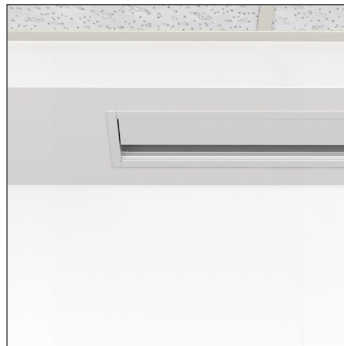
In Ceiling (Closed)