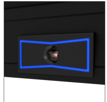
Camera in Slat Bar