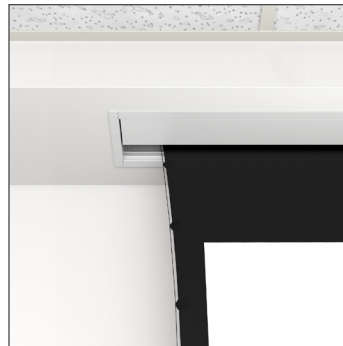
In Ceiling (Open)